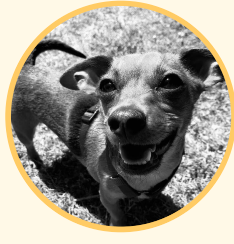
Chorizo Property Engagement Support (She/Queen)