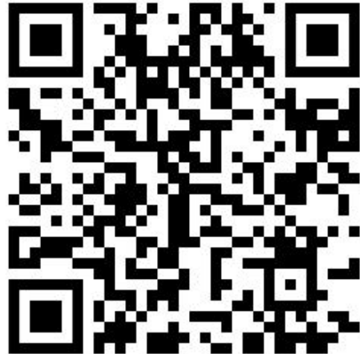
VA Resource Links