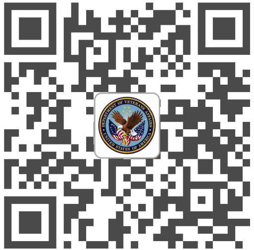
My Digital Business Card