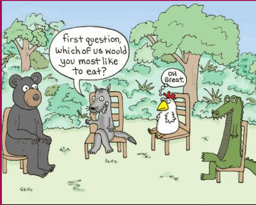
Ice breakers in the wild